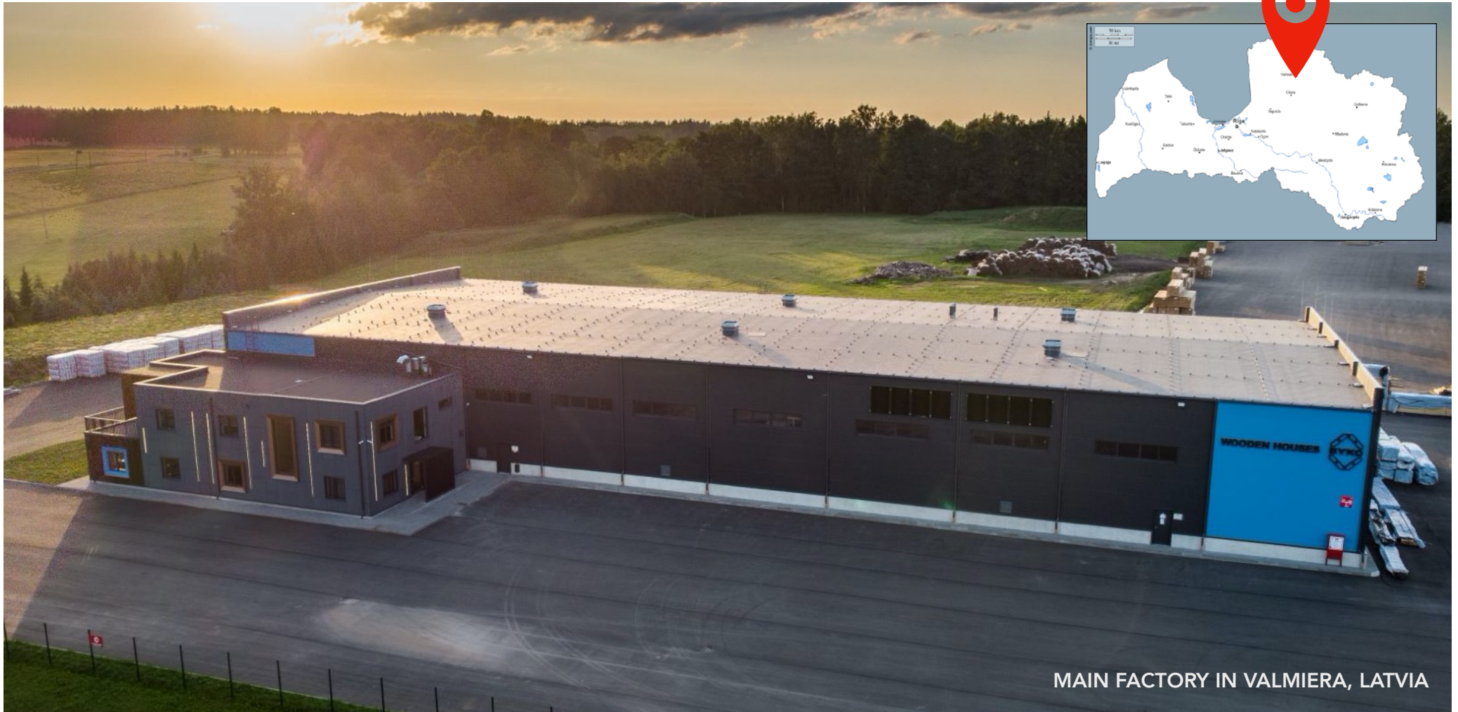
MAIN FACTORY IN VALMIERA, LATVIA